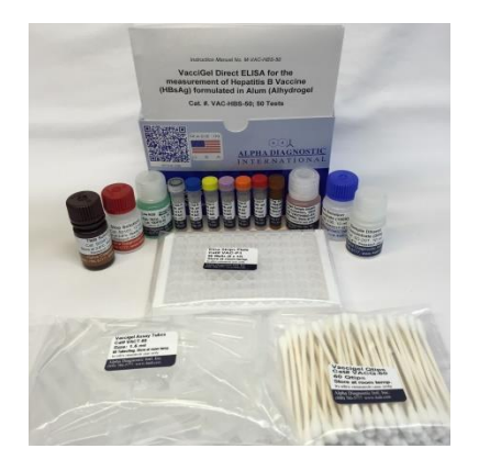
For In Vitro Research Use Only