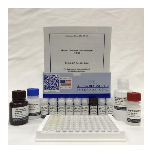
For In Vitro Research Use Only

For Quantitative Determination of HCG In Human Serum